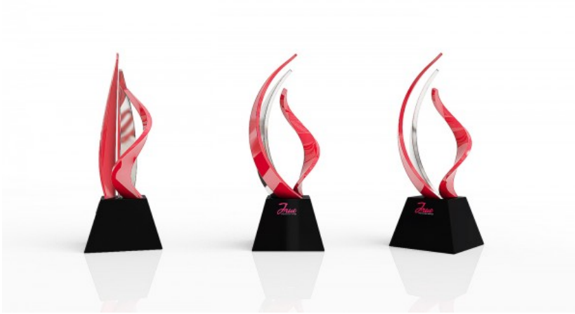
Design for Chick-Fil-A's True Inspiration Awards

Is there a project that stands out to you as having been the biggest challenge of your career so far?