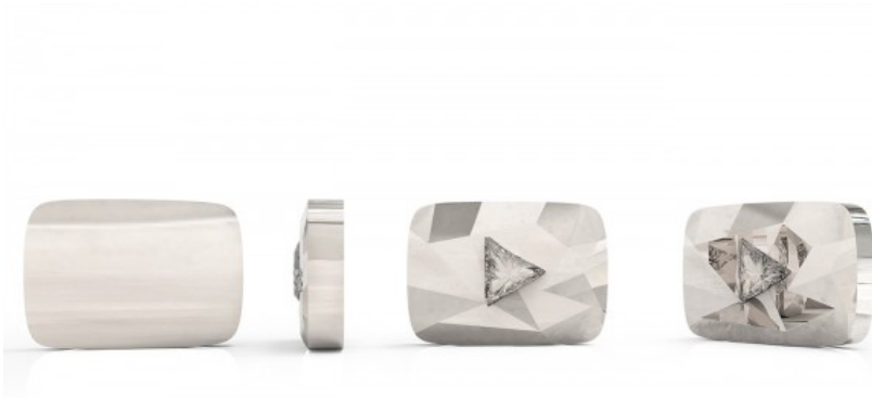
Design for the YouTube Diamond award

Some of the projects that stand out would be Chick-Fil-A, True Inspiration Award and NFLPA Collegiate bowl 2015 for their creative process , YouTube Diamond award for its technical and production process. Lalique + Patron as well as DonQ stand out for [their] technical aspects blended with the creative design, plus the growth they provided me as a designer. What also stands out is seeing the whole process, from design to production to budget—just seeing the whole team work at it is awesome.